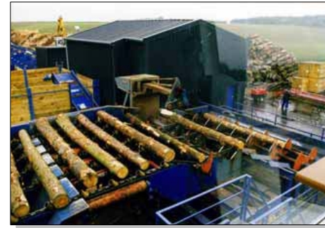
Butt reducing line