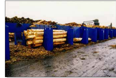
Log sorting line with bins for debarked logs