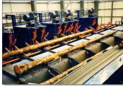
High capacity cross-cutting line for long poles

Also machinery for butt-reduction and debarking can be integrated.